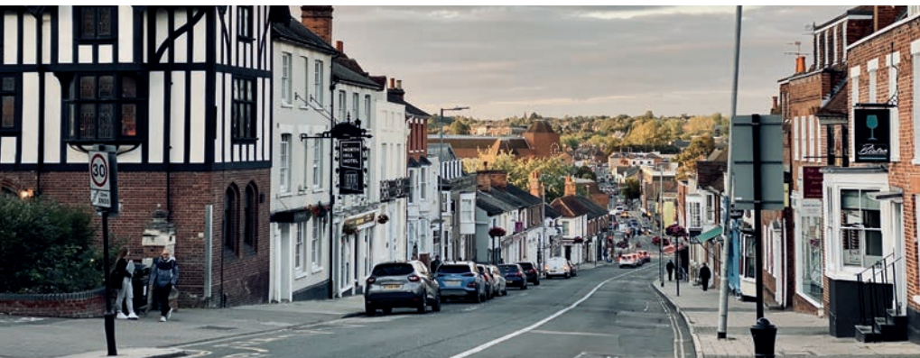
Produced on behalf of Hopkins Homes by Smarter Travel Ltd

Alongside your travel voucher you can also claim a free Personal Travel Plan - providing you with alternative travel options with a comparison of: time, cost, CO 2 saved and calories burned!